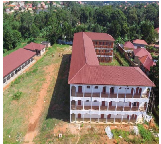
Libermann Academy Namugongo