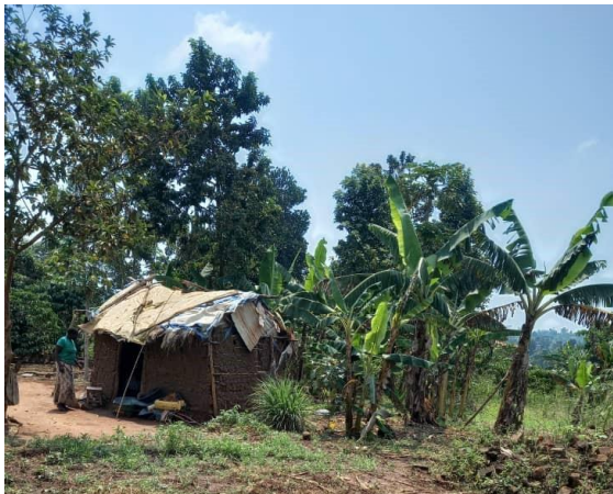
Homestead environment in Namasumbi