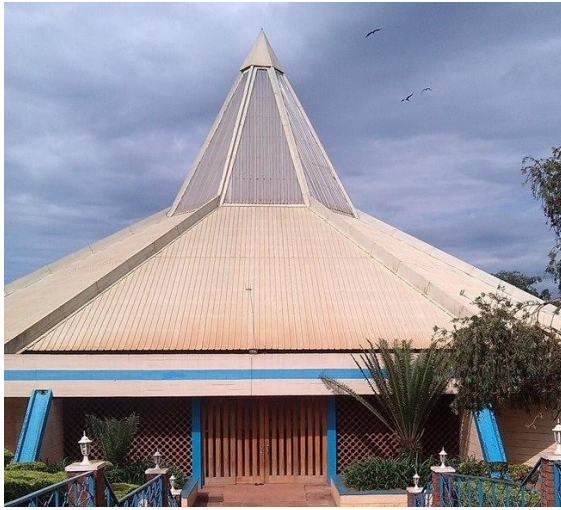
Our Lady help of the sick Mulago Church