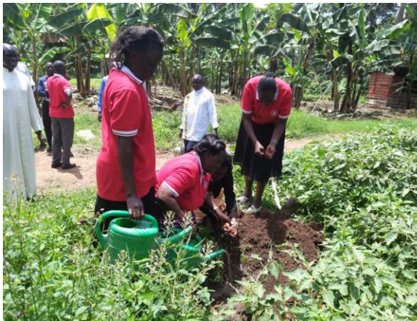
Cross section Namugongo Spiritan farm