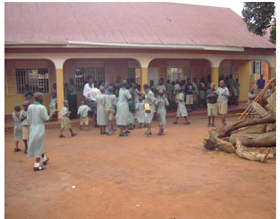
Mulago School for the Deaf - SNE